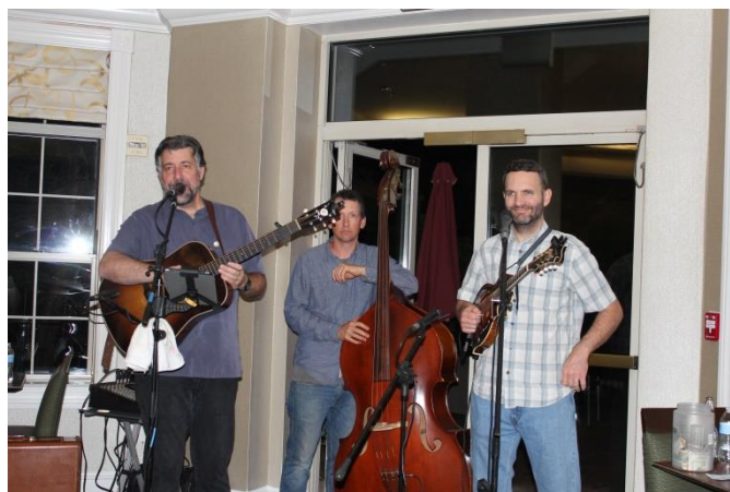
The Gallatin Canyon Band