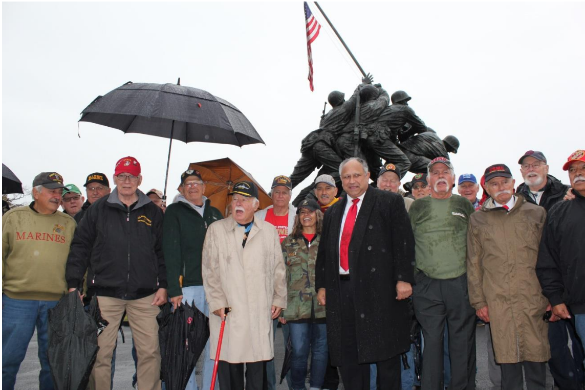
Holding the cane in the center of the photo is 2/9 Medal of Honor recipient Barney Barnum. Next to him in the dark overcoat is Secretary of the Navy Carlos Del Toro.