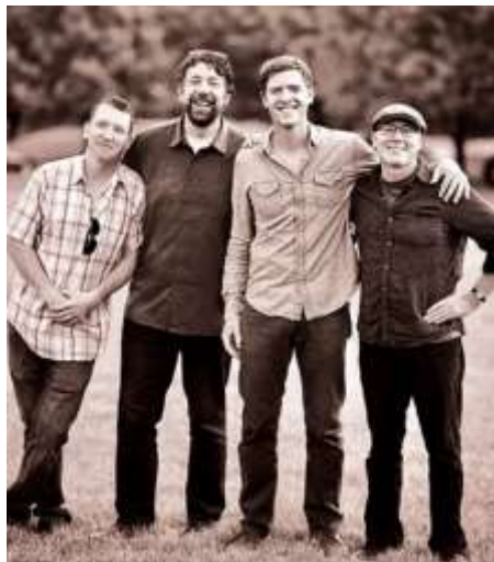
The GALLATIN CANYON BAND