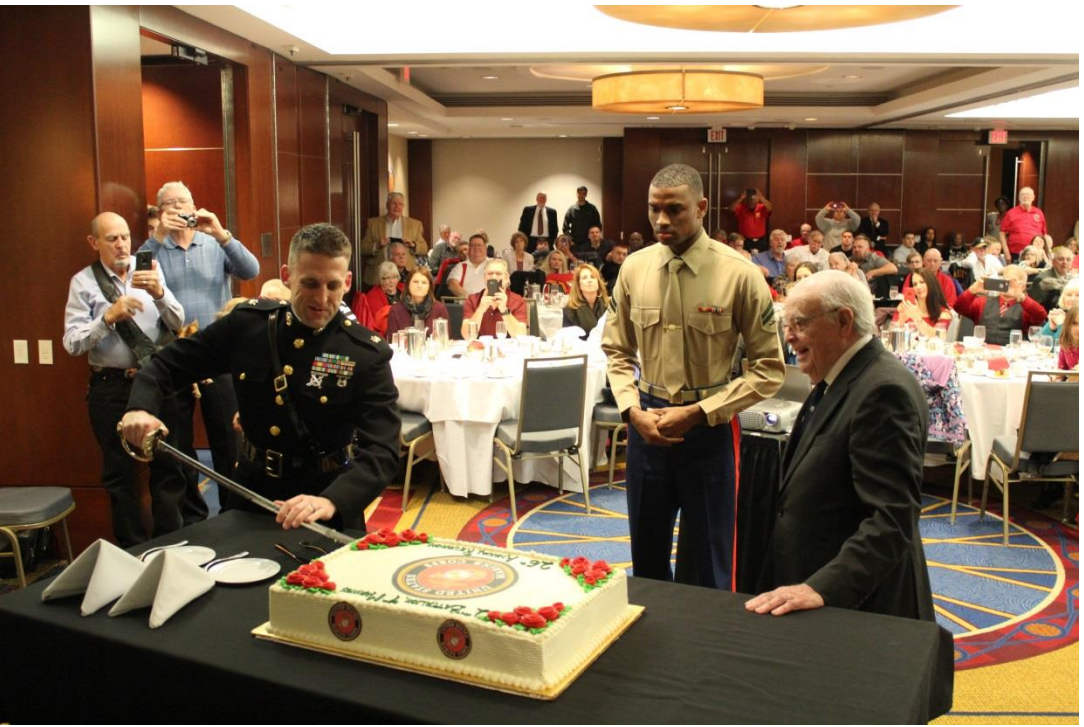
Cake cutting ceremony - 2018

Marriott Key Bridge Hotel 1800 Hours, 10 November 2019